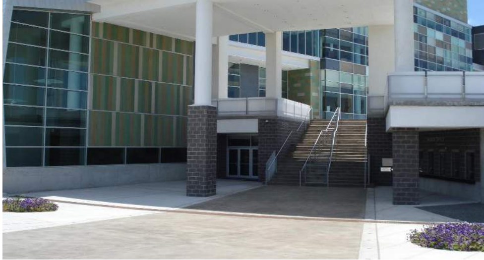
The Long Center's Grand Staircase to main entrance of Dell Hall on the right Rollins Lobby Doors are to the left of the stairs at ground level – FOH access to Kodosky