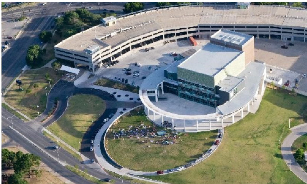
Aerial photo of The Long Center & Palmer Events Center Parking Garage