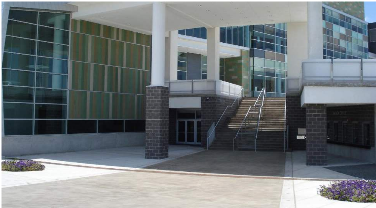
The Long Center's Grand Staircase to main entrance of Dell Hall on the right Rollins Lobby Doors are to the left of the stairs at ground level – for access to AT&T