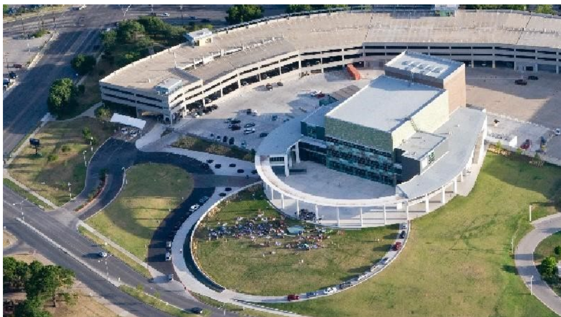
Aerial photo of The Long Center & Palmer Events Center Parking Garage