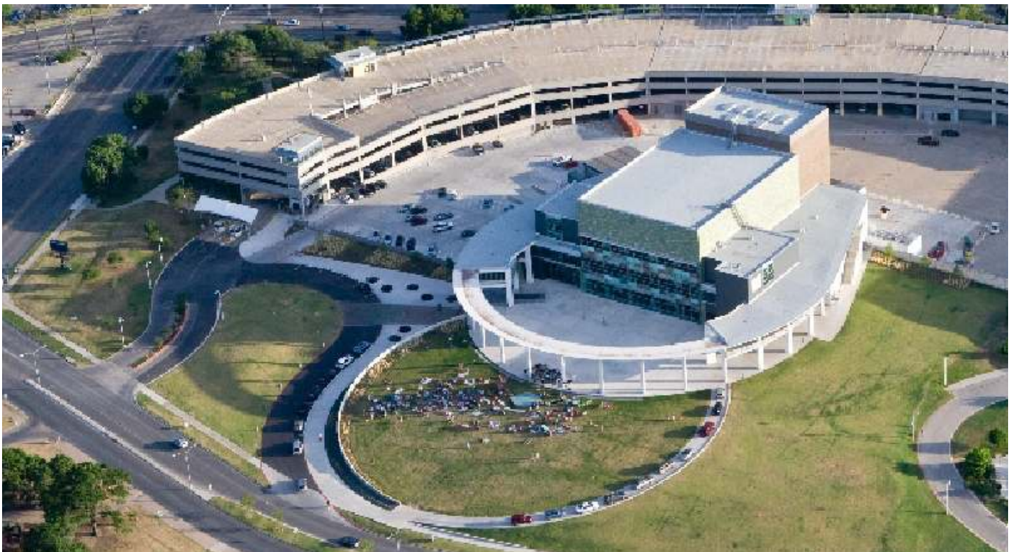
Aerial photo of The Long Center & Palmer Events Center Parking Garage