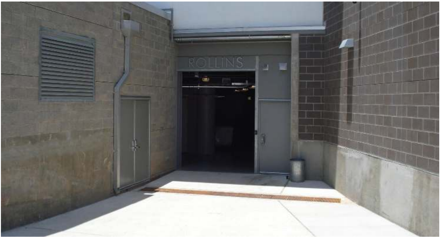
Rollins Studio Theatre Loading Dock