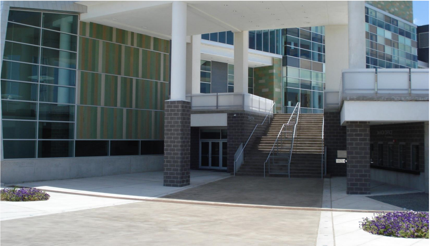
The Long Center's Grand Staircase to main entrance of Dell Hall on the right Rollins Lobby Doors are to the left of the stairs at ground level – for access to AT&T