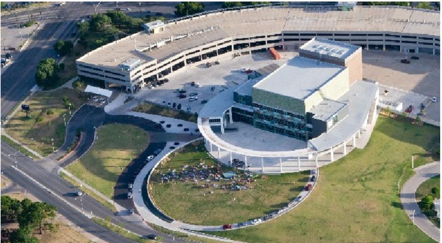
Aerial photo of The Long Center & Palmer Events Center Parking Garage