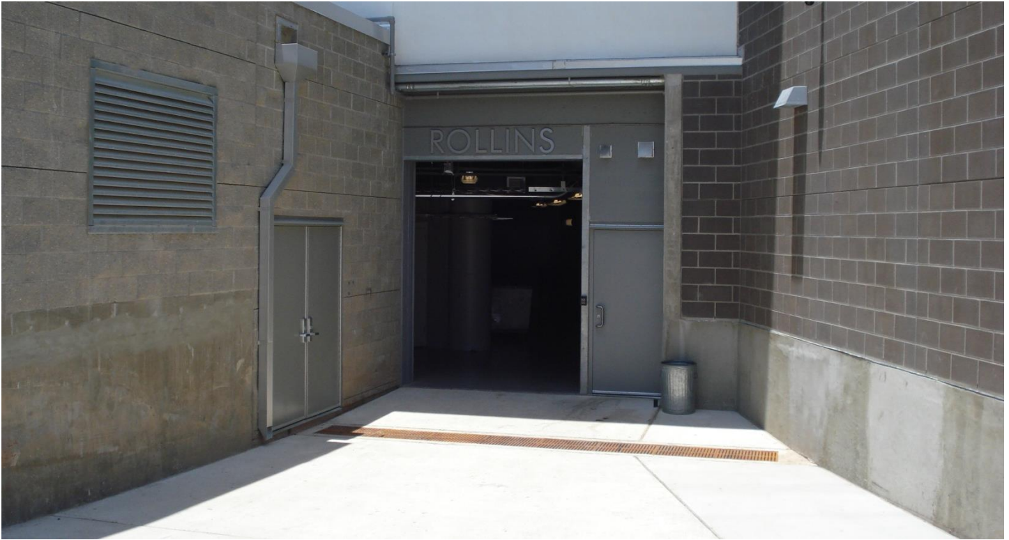
Rollins Studio Theatre Loading Dock